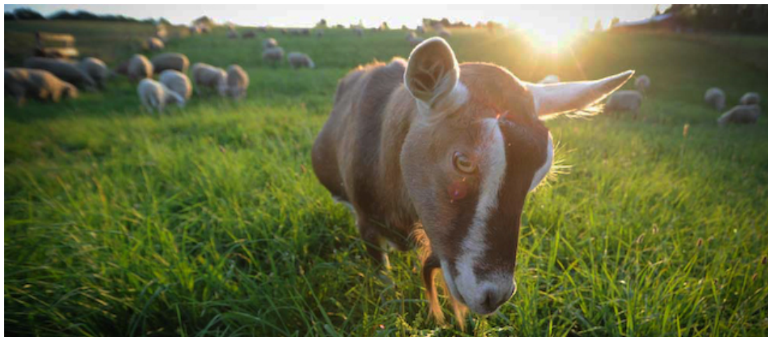
"Clarabelle in the sunset at Farm Sanctuary, USA."

Check out Jo-Anne McArthur's new photo album and blog on our website called " Celebrating Empathy ."